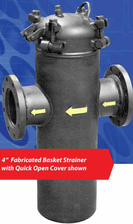
4" Fabricated Basket Strainer with Quick Open Cover shown

Fabricated Basket strainers are required when an off-the-shelf solution will not meet your exact piping requirements. All of our Fabricated Strainers are made right here in the USA, at our state-of-the-art facility in the southeastern part of North Carolina.