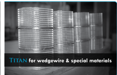
TITAN for wedgewire &amp; special materials

Titan FCI manufactures special screens and baskets for extreme pipeline conditions. Pictured above are screens made of wedgewire straining material which provides great strength and durability while maintaining a large open-area ratio.