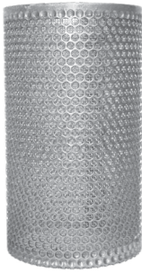
Cylindrical Screen, Style 'A'