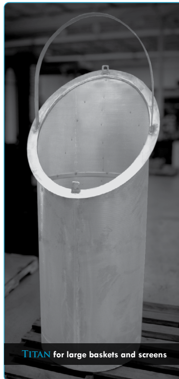
TITAN for large baskets and screens