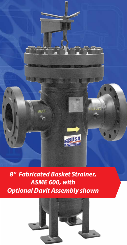
8" Fabricated Basket Strainer, ASME 600, with Optional Davit Assembly shown

Fabricated Basket strainers are required when an off-the-shelf solution will not meet your exact piping requirements. All of our Fabricated Strainers are made right here in the USA, at our state-of-the-art facility in the southeastern part of North Carolina.