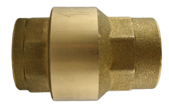
Figure 1: CV 20-BZ 1/4" ~ 2" 400 WOG • 2 1/2" ~ 4" WOG Brass Body • Buna-N Seat