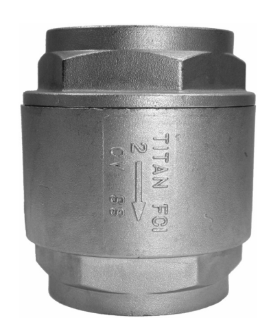
Figure 2: CV 80-SS ANSI Class 150/300 Stainless Steel Body • PTFE Seat