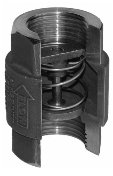
Figure 6: Stainless Threaded End Check Valve Internal Cutaway View (Old Style)

THIS WARRANTY IS IN LIEU OF ANY OTHER WARRANTIES, EXPRESS OR IMPLIED, INCLUDING ANY IMPLIED WARRANTY OF FITNESS OR MERCHANTABILITY. SELLER SHALL NOT BE LIABLE FORANY SPECIAL, INCIDENTAL, OR CONSEQUENTIAL DAMAGES. NO REPRESENTATIVE OR SELLER HAS AUTHORITY TO MAKE ANY REPRESENTATIONS OR WARRANTIES, EXCEPT AS STATED HEREIN.