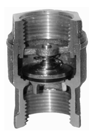
Figure 7: Bronze Threaded End Check Valve Internal Cutaway View (Old Style)