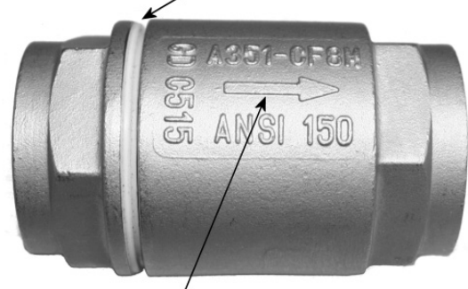
Flow arrow must be pointed in the direction of the flow.

Ensure gaps are not present at the body joint.