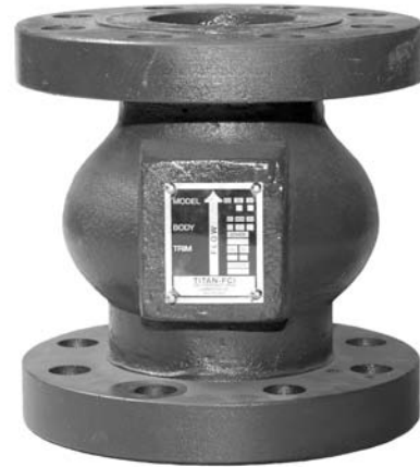
Figure 1: CV 52-DI ANSI Class 250/300 • Ductile Iron

Please contact a Titan Design Engineer to assist in the determination of these requirements prior to selection and purchase.