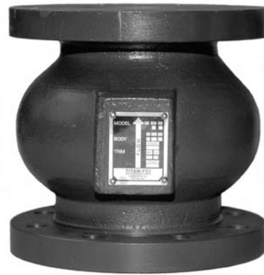
Figure 3: CV 50-DI ANSI Class 150 • Ductile Iron