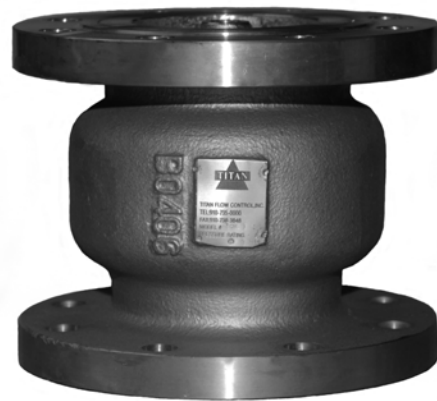
Figure 2: CV 51-SS ANSI Class 150 • Stainless Steel