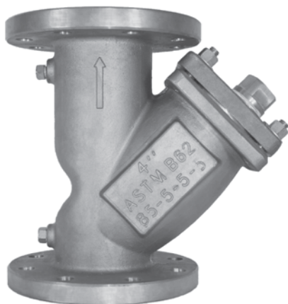
4" YS 54-BZ