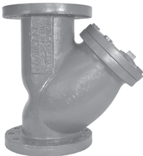
6" YS 59-CI