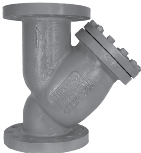
6" YS 62-CS

Models: YS 62-CS (Carbon Steel) YS 62-SS (Stainless Steel)