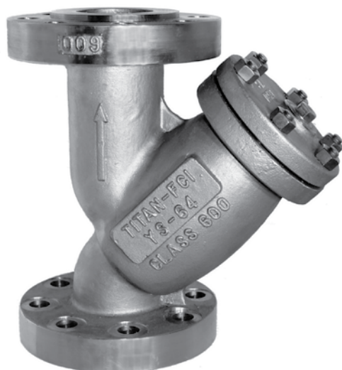
3" YS 64-SS

Models: YS 64-CS (Carbon Steel) YS 64-SS (Stainless Steel)