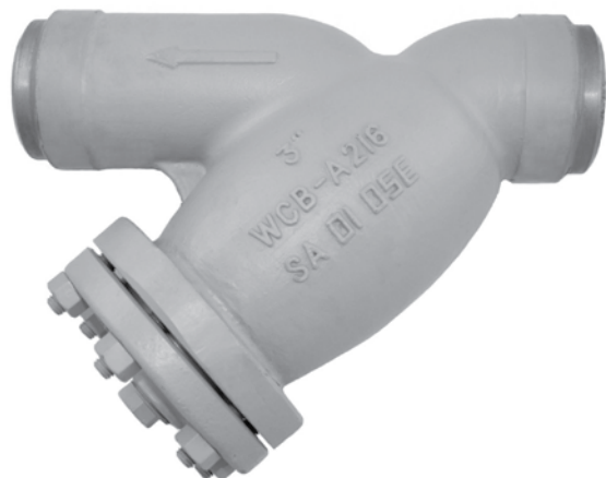
3" YS 65-CS

Class 600 lb • CARBON STEEL & STAINLESS STEEL